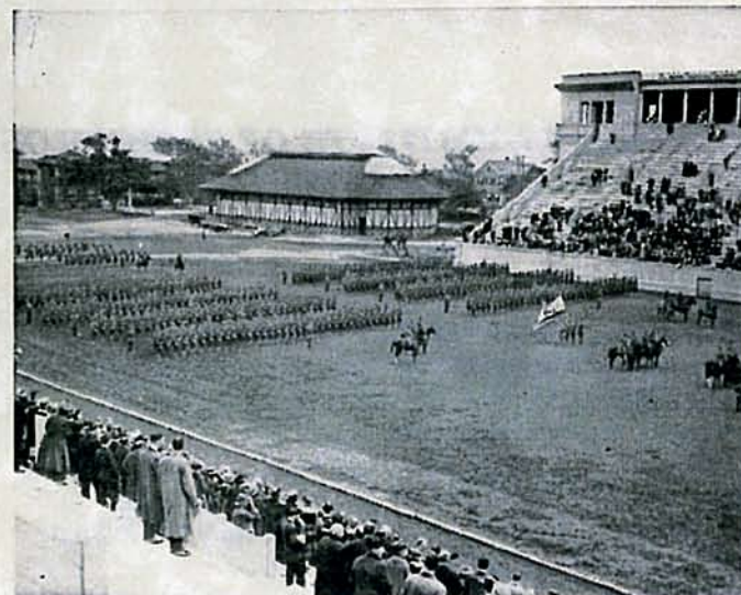
Army's Harvard Regimental Review at Harvard Stadium 1916