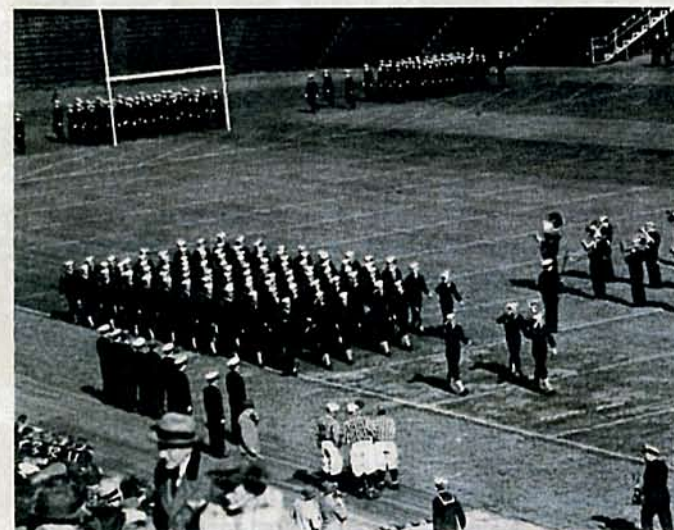
Navy's ROTC Review at Harvard Stadium c. 1955

For more information and photos, please visit www.bpl.org.