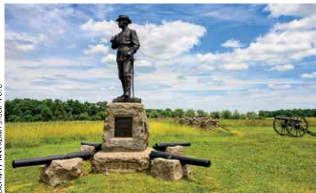
Major General John Buford is honored near Gettysburg National Military Park.

The preservation movement coalesced quickly in 1993 when the Walt Disney Company announced its plan to build an American history-themed amusement park about