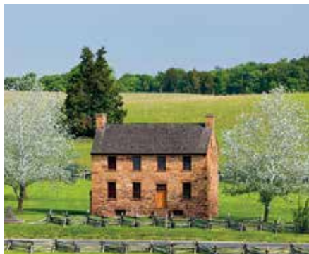
Manassas National Battlefield Park

follow those rules don't belong here.' I found that viewpoint informative and understood that perspective. But then you saw little kids starting the 'Build the wall' and 'Lock her up' chants, and adults thinking it was funny. It was disturbing." Then, that January, he and his daughter were among the throngs in D.C. for the inauguration, and then for the next day's Women's March. "Those experiences gave my daughter especially a real lesson of our democracy in action."