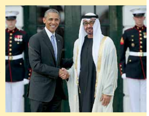
President Obama welcomes the crown prince of Abu Dhabi. But U.S. politics can pressure a president to use military, rather than diplomatic, foreign-policy tools.

The pressures to use the military are accompanied by constraints on using other foreign policy instruments. Congress has made international trade negotiations difficult since there is not enough support to delegate trade authority to the president. The fiscal austerity imposed by Congress has made increasing foreign aid very difficult. Immigration policy has been blocked in Congress. Sanctions face interest group resistance