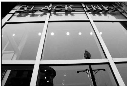
Black Ink...what's in store?