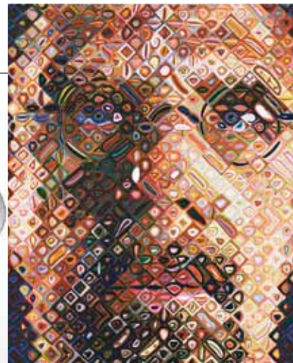
Above, left: Koji Tatsuno (1993 collection), Peabody Essex Museum; Chuck Close’s Self-Portrait Woodcut (2009), Bruce Museum