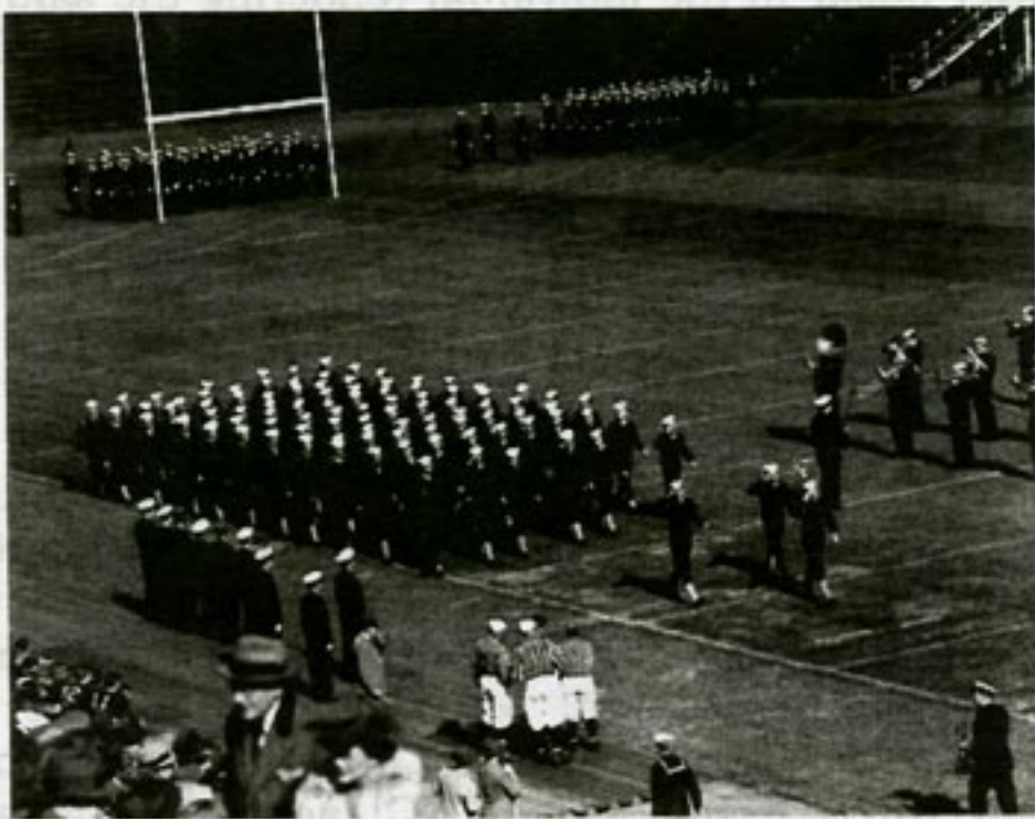
Navy's ROTC Review at Harvard Stadium c. 1955