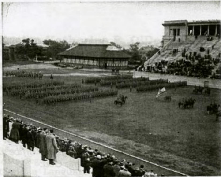
Army's Harvard Regimental Review at Harvard Stadium 1916